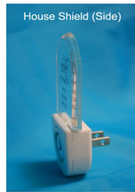
House Shield (Side)

Compare Price, Appeal/Beauty, Effectiveness with our competitors below If you are not thrilled in 30 Days... Your Money Back Guaranteed!!!