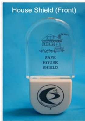
House Shield (Front)